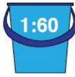
Mop & Bucket (diluted solution)